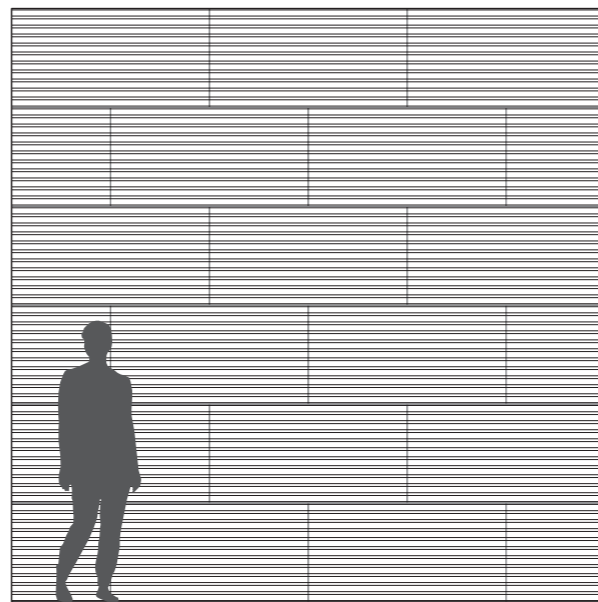
Acoustex line installed horizontally